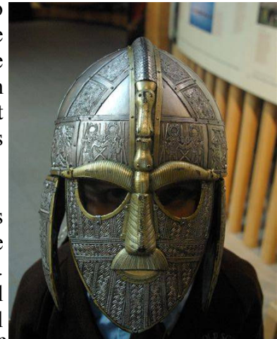
Is that a Henstead pupil behind the mask?

Year 3 to Sutton Hoo - The weather was much kinder to Year 3 who enjoyed a fantastic day at Sutton Hoo yesterday. The day began in the Exhibition Centre with work sheets to be completed and facts to be discovered. After watching an introductory film the children discovered just how uncomfortable it is to wear heavy chain mail, that Anglo Saxon clothes were very itchy and that wearing the famous helmet limits your field of vision.